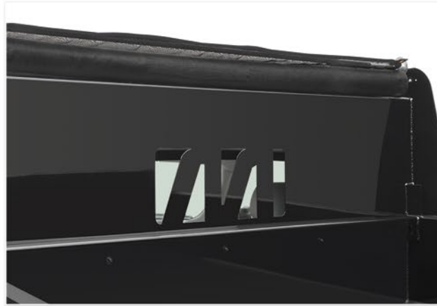
Morgan's heavy-duty steel bulkhead construction helps to protect cab and crew, while the innovative window supports greater visibility to the side and rear.