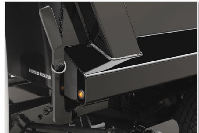
Single, and separate rubber-coated drop and swing-gate handles make it easy for one-person to release and re-secure the dump gate.