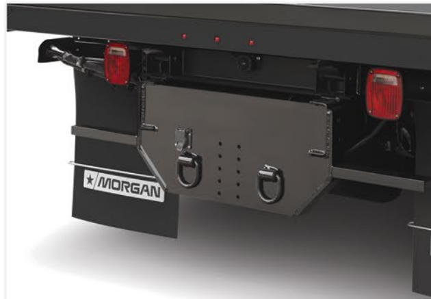
Chassis-mounted features such as the underbody bumper, hitch plate, mudflap mounts, anti-sail braces, and fuel and DEF-fill ports, minimize wear and tear on components and support greater longevity and performance.