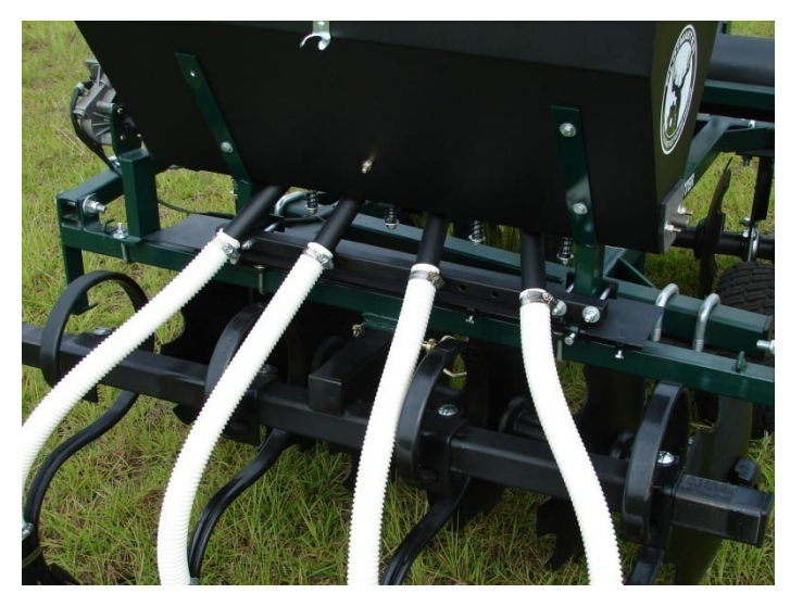
SMOOTH INSIDE WALLS FOR GOOD SEED FLOW.

4 WHITE FLEX HOSES, RIBBED OUTSIDE FOR DURABILITY,