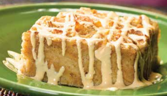
WHITE CHOCOLATE BREAD PUDDING