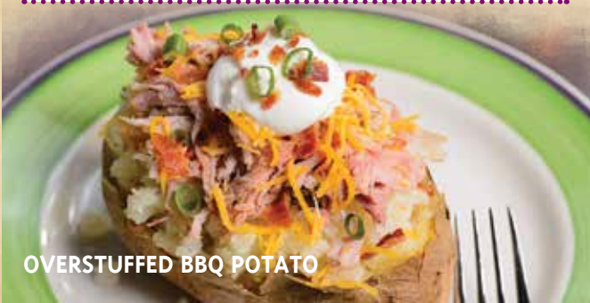
OVERSTUFFED BBQ POTATO

Baked Potato, 1 Slow Smoked BBQ Meat, Cheddar Cheese, Butter, Sour Cream & Green Onions