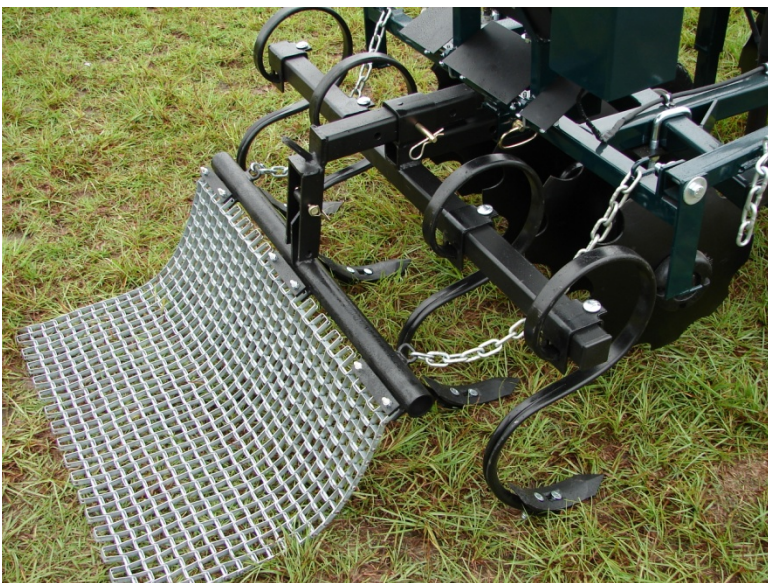
Metal Drag used in Tandem with Chisel Plow Attachment

These extra sharp spikes/chisel points penetrate the soil with ease and increase the down pressure forcing the discs deeper into your soils for increased tillage.