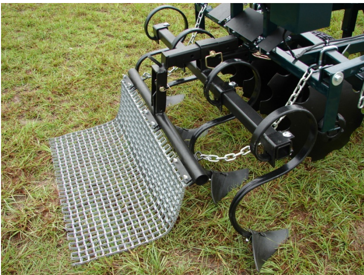
Metal Drag used in Tandem with Turning Plow Attachment

These turning tips also increase the down pressure on your Plotmaster forcing the discs deeper into your soils for increased tillage.