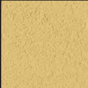
Typical example of small knockdown.

Anvil Ultra Tex 2200's unique consistency quickly and effectively hides surface imperfections, fills nail holes and bridges small cracks with little or no additional work beyond normal application. Combined with Ultra Tex's infinite array of texture and color combinations, it's the perfect solution for textural wall surfaces.