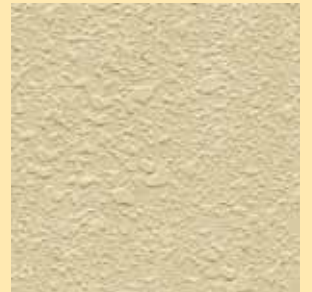
Splatter finish technique.

Anvil Ultra Tex 2200 combines the color diversity of paint with the texture options of plaster to deliver the most versatile wall covering available. Unlike paint and drywall texture, Ultra Tex 2200 offers solid color completely throughout the finish for added durability. Color choices for the base and texture coats range from pastel to medium, and can be custom-color matched to project specifications. A skilled contractor/applicator can achieve a variety of textured finishes. Design options are limitless with the new aggregated texture choices.