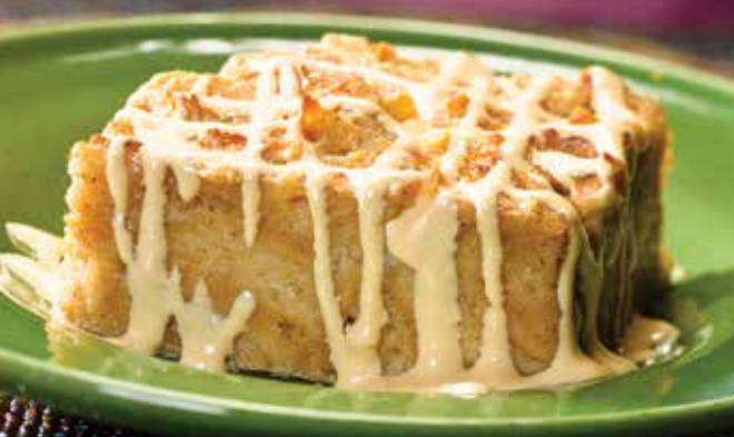
WHITE CHOCOLATE BREAD PUDDING