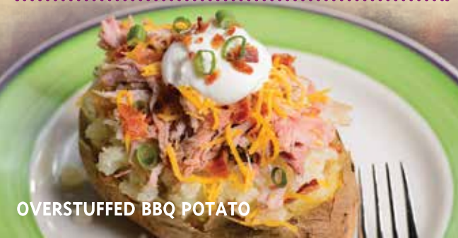
OVERSTUFFED BBQ POTATO

Baked Potato, 1 Slow Smoked BBQ Meat, Cheddar Cheese, Butter, Sour Cream & Green Onions