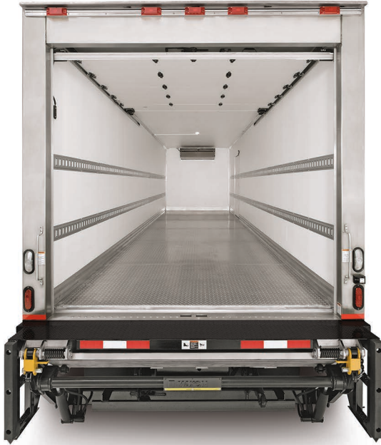
Cargo Interior Shown with E-track