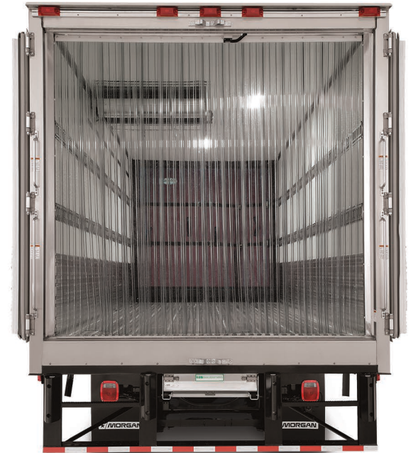
Cargo Interior Shown With E-track, Bulkhead/Multi-Temp Configuration and Strip-Curtain