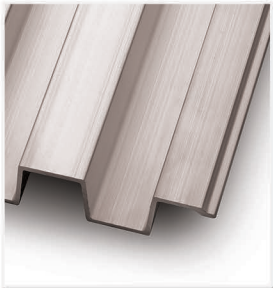
1 1/4" Aluminum (Hat) Floor