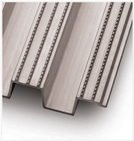
1 1/4" Aluminum (Hat) Floor with Anti-Skid Surface