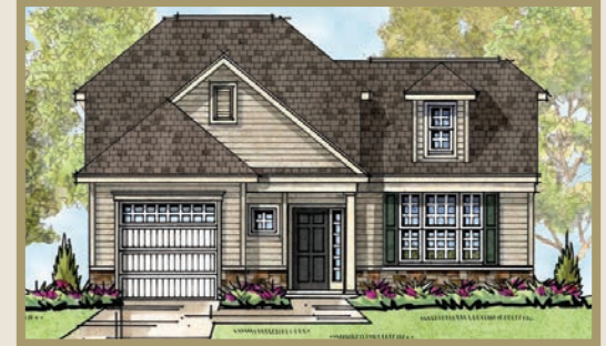
Traditional Style 2