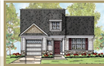
Traditional Style 3