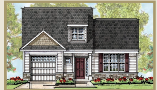
Traditional Style 3

Floor Plan and Elevation Images as Shown are Artists Renderings and are Subject to Change Without Notice. All homes are Offered by the Developer as Two Bedroom Units.