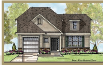
Traditional Style 2