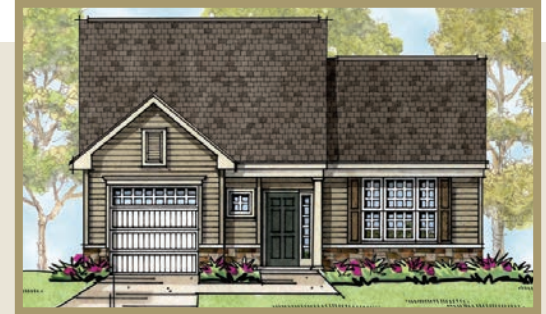
Traditional Style 1