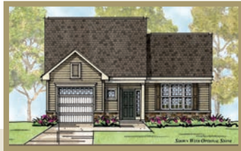
Traditional Style 1