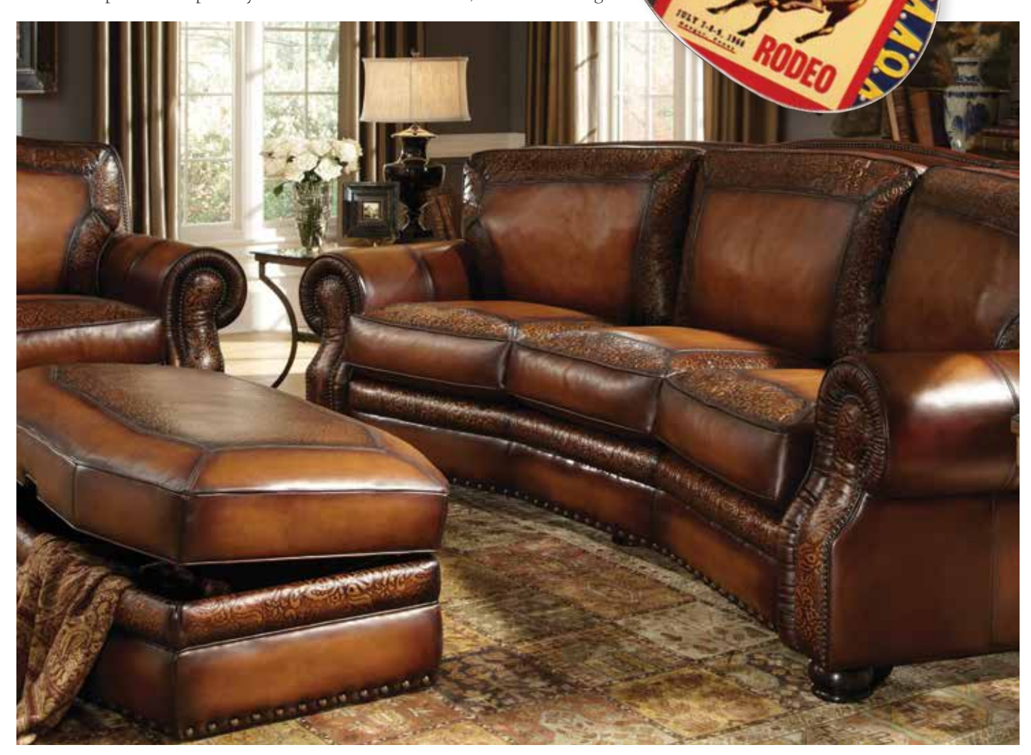
This page, from top: The mixed media Rodeo guitar is from Carol Braden Guitars. Photo: Courtesy Carol Braden | Antiqued cowhide is trimmed with a hand-tooled damask motif in The Eleanor Rigby Leather Company's Weatherford collection. Photo: Courtesy of Eleanor Rigby Leather Company

The center's furnishings can work in many different interiors, according to Campbell. "Our primary draw is the Western market, but we encourage