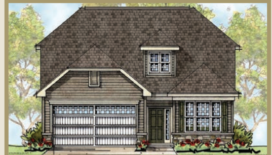
Traditional Style 3