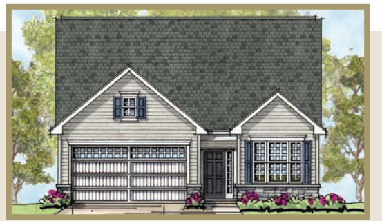
Traditional Style 1