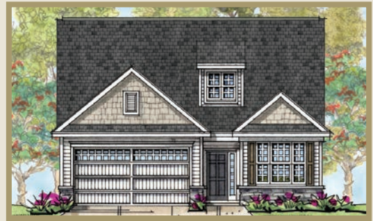
Traditional\ Style\ 2