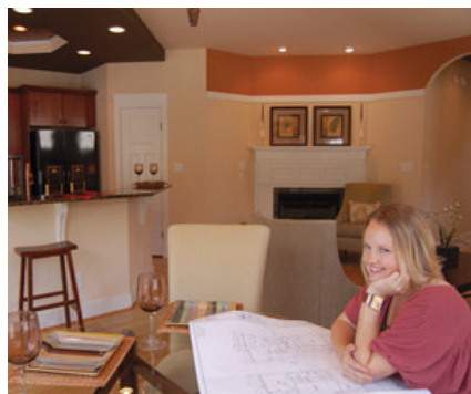
Multiple archways and paint colors are common in Britney's designs.

After completing the homes on Paladin Court, Britney immersed herself in the design and construction of 39 homes in Southwest Durham's Patterson Glen. Currently underway, Patterson Glen consists of Craftsman-style townhomes ranging from 1,600 – 2,100 square feet. As with her Paladin Court homes, custom trim, granite countertops, upgraded cabinetry, luxurious bathrooms, and detached garages are but a few of the many standard features.