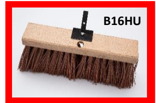
16" Heavy Use