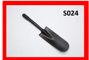
14" Drain Spade