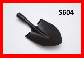
#2 Round Point 16 ga.