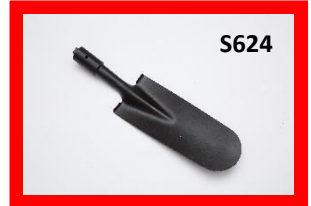
14" Drain Spade 16 ga.