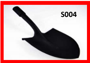
#2 Round Point Shovel