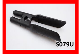
Post Hole Digger