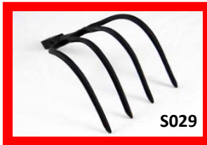
4-Prong Manure Hook