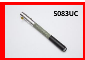
Short Striking Handle