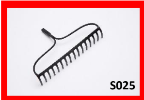
Forged Bow Rake