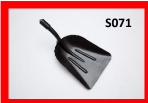
Scoop Shovel (Steel)