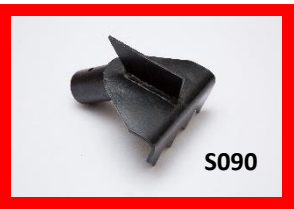
Dry Wall Hook