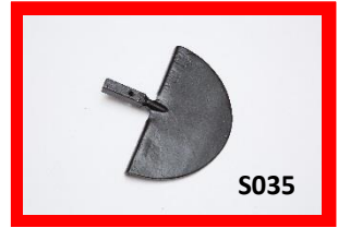
Half Moon Turf Edger