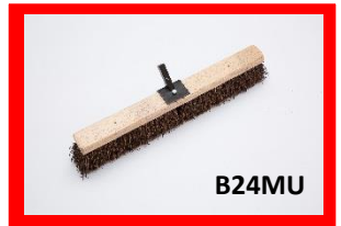
24" Broom Medium Use