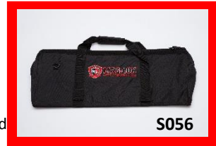
Nylon Tool Bag