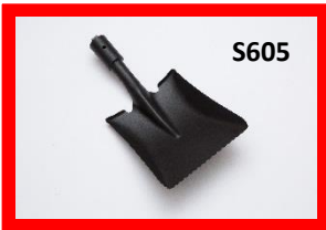
Square Shovel 16 ga.