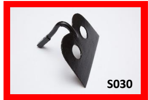
10"x6" Mortar Hoe (Open)