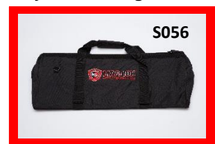
Nylon Tool Bag