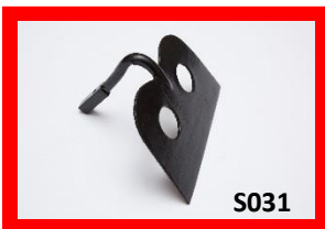
9"x6" Mortar Hoe (Open)