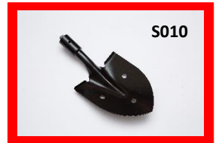
Mud Shovel 16 ga.