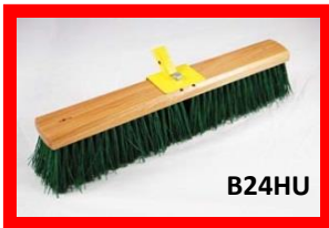
24" Heavy Use