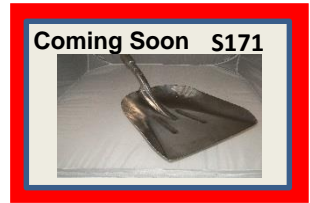
Coming Soon S171