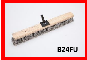
24" Broom Fine Use