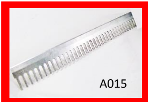
36" Landscape Rake