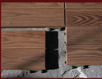
Install on flat surface