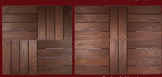
Option 3. Mosaic patterns