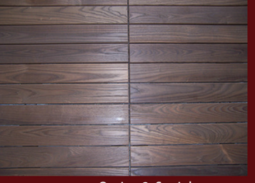
Option 2. Straight pattern