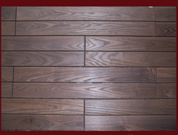
Option 1. Offset pattern

Decking ages gracefully to silver-grey tones. To help maintain original color tones, apply a UV protectant deck oil.