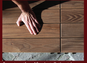
o together. After installation trim tic tabs from exposed edges... Ready!