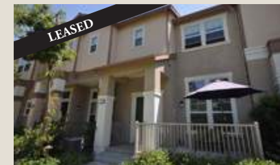
17 Durlston Way, Ladera Ranch 2 BD | 2.5 BA | 1,620 SF $2,750