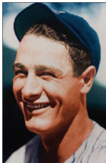
NY Yankee Lou Gehrig