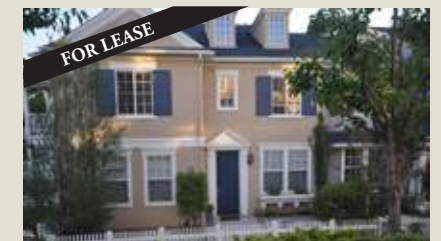
45 Strawflower, Ladera Ranch 3 BD | 2.5 BA | 1,530 SF $2,750

Ladera Ranch Resident, Knowledgeable & highly accessible Orange Coast Magazine 5 Star Award Recipient 2010, 2011, 2012, 2013, and 2014. Find out why so many of your neighbors put their trust in Cathie.