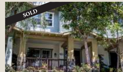
4 Sheridan Lane, Ladera Ranch 2 BD | 2.5 BA | 1,620 SF $460,000 (Represented Seller)