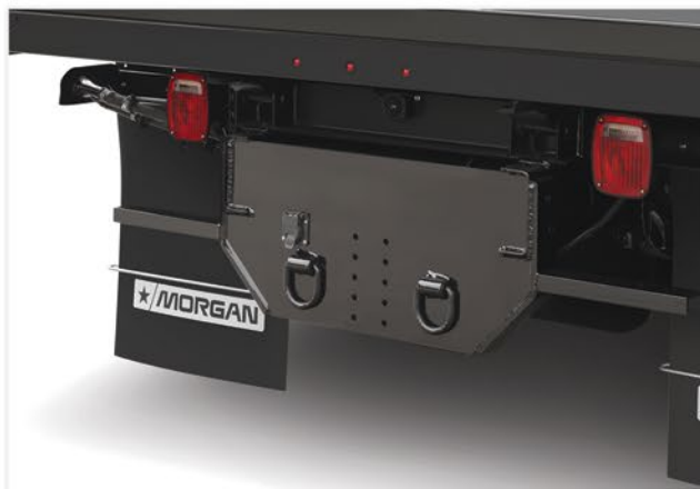
Chassis-mounted features such as the underbody bumper, hitch plate, mudflap mounts, anti-sail braces, and fuel and DEF-fill ports, minimize wear and tear on components and support greater longevity and performance.