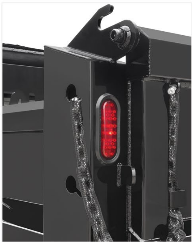
Heavy-duty mesh chain covers and redundant recessed lighting enhance safety.

Welded steel assembly, 17" high 10-and-12-gauge double sidewalls, a 10-gauge steel floor, and a 23" 12-gauge steel dump/swing gate make a Morgan body tough-enough to handle whatever the job requires. That promise is backed by Morgan's 3 Year Warranty AND a reputation for innovative design and quality construction that spans over 60 years!