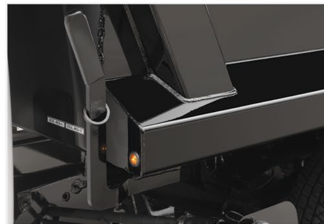
Single, and separate rubber-coated drop and swing-gate handles make it easy for one-person to release and re-secure the dump gate.