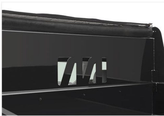
Morgan's heavy-duty steel bulkhead construction helps to protect cab and crew, while the innovative window supports greater visibility to the side and rear.