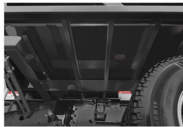
Welded steel construction, 5" structural channel longrails, and 3" crossmembers positioned 12-inches on-center, mean Morgan dump bodies are designed and BUILT to deliver the strength and durability you WILL depend on.