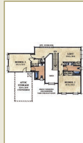
Second Floor Option 2 - 954 sq.ft.

The Wycombe II features a large formal dining room and a spacious study on the main level. The great room is adjacent to the breakfast area and gourmet kitchen with 7 foot center island. An optional sunroom can be added with an L shaped island. Two spacious walk-in closets connect the owner's suite to the owner's bath featuring separate sinks. The second level of the Wycombe II is finished with a bedroom, bath and pocket library as the standard configuration. A two bedroom, two bath and loft version is also available.