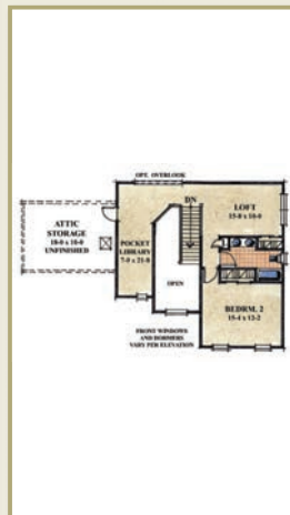
Second Floor Standard - 720 sq.ft.